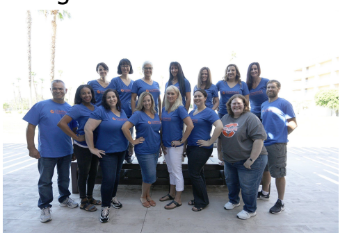
High School Team